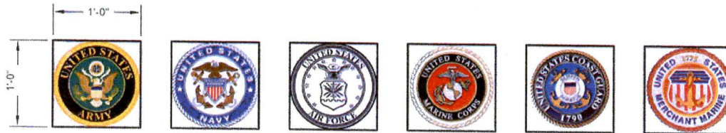
MILITARY BRANCH PLAQUES